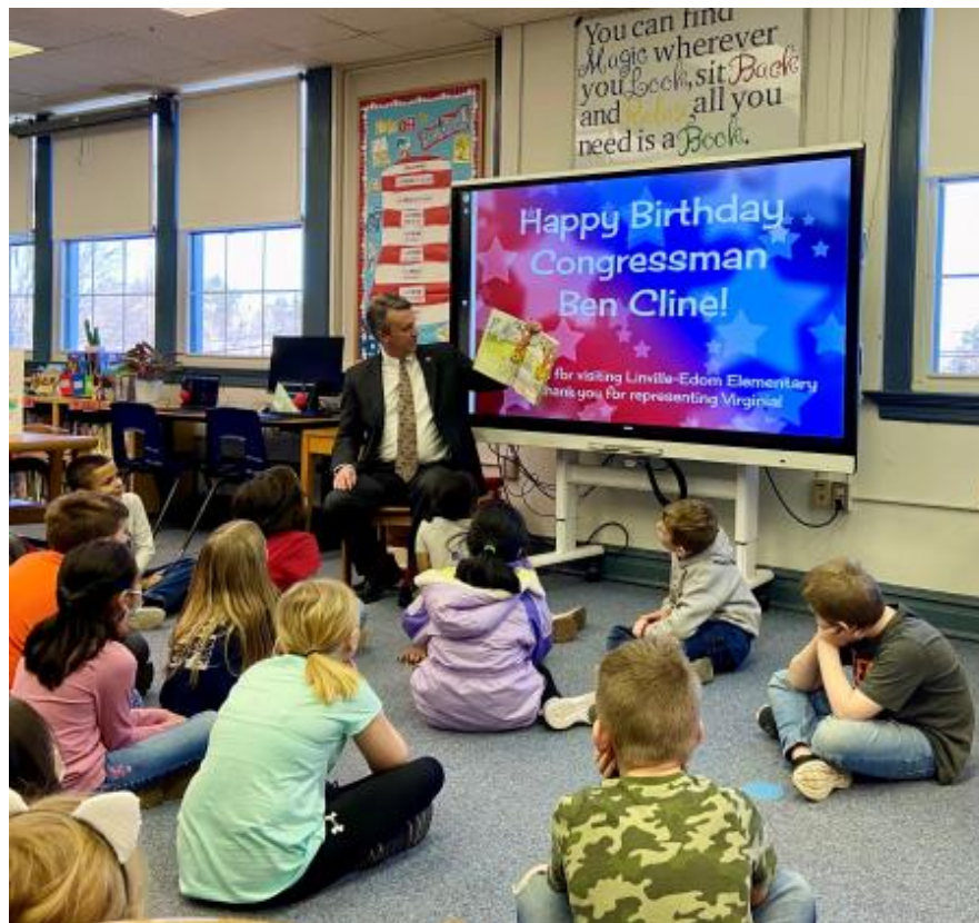
Rep. Cline reads to students at Linville-Edom Elementary School

As the Representative for Virginia's Sixth District, one of my top priorities is making myself available to meet with constituents whether I'm here in the Commonwealth or in Washington. This week, I was pleased to read with students in Linville and hear from various advocacy groups from across our region.