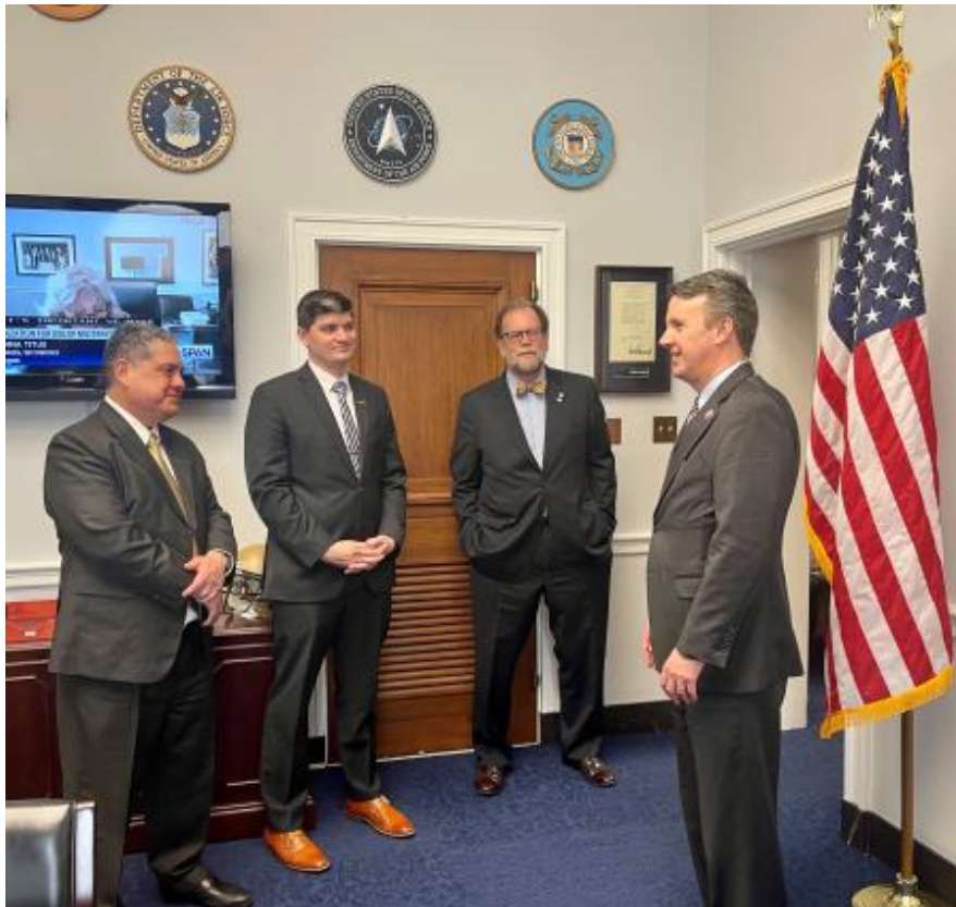
Rep. Cline meets with Veteran representatives from Iraq and Afghanistan Veterans of America and the Independence Fund