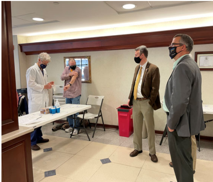
Valley Health Vaccine Clinic (Woodstock)