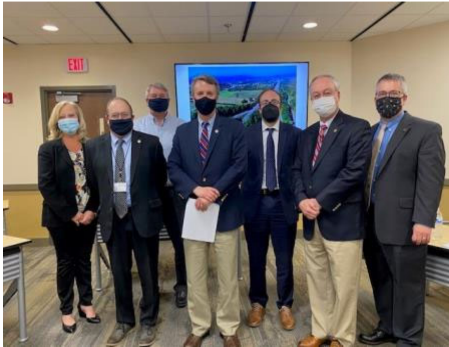
Roanoke Economic Development Update