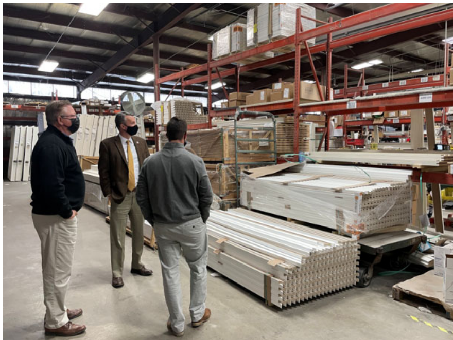
Rocco Building Supplies (Harrisonburg)