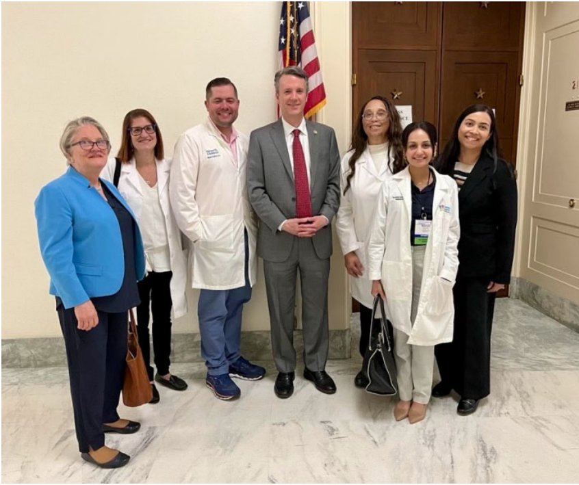
It was a pleasure to meet with the American Academy of Pediatrics and discuss ways to ensure important access to care for children in the Sixth District.