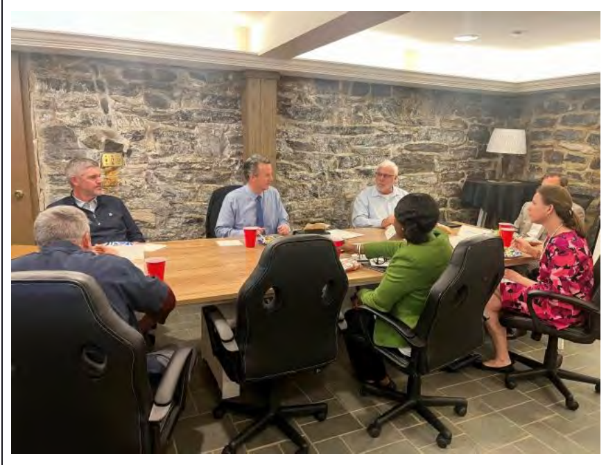
The Costly Consequences of Biden's Border Crisis

Employing 1.6 million people, Virginia is home to more than 800,000 small businesses, which account for almost 99.5% of businesses in the Commonwealth. As small businesses continue to suffer due to rising inflation, burdensome regulations, and high taxes under Biden's reckless economic policies, we need to find solutions that alleviate, not exacerbate the pressures small businesses are facing. Last week my Small Business Advisory Group met in Winchester to discuss policies Congress can implement regarding small businesses. My office will continue to be a strong advocate and create a better environment where small businesses can thrive.