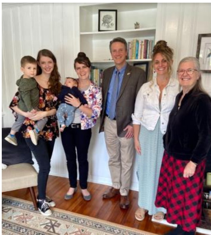
I enjoyed celebrating National Midwifery Week at Trillium House in Lynchburg.