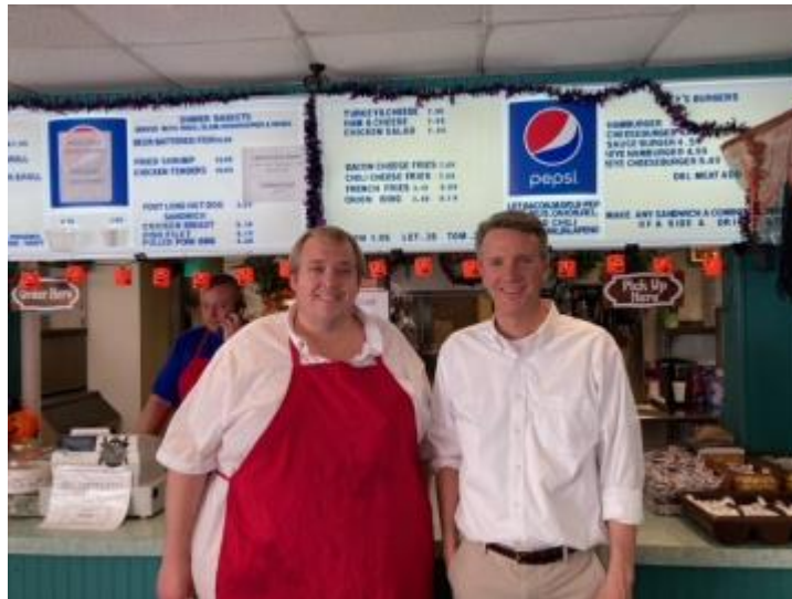
I stopped by "The Barn" in Waynesboro that serves up delicious fried chicken and coconut pie.