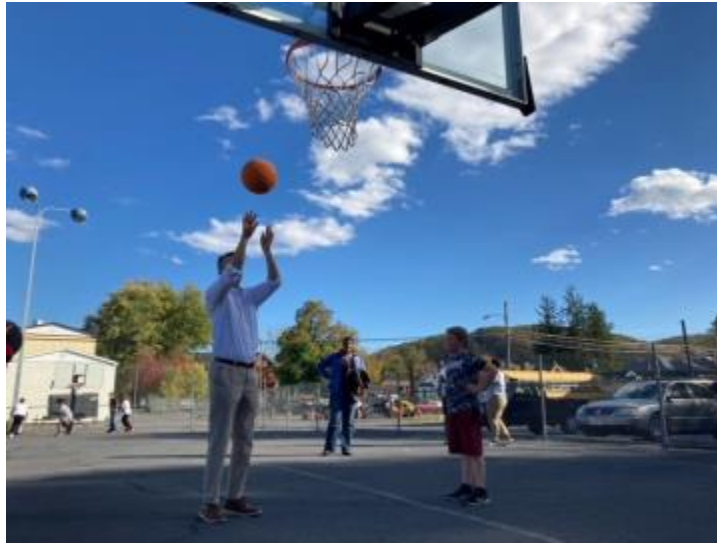
It was great visiting the Boys & Girls Club in Waynesboro and shooting hoops with the kids!