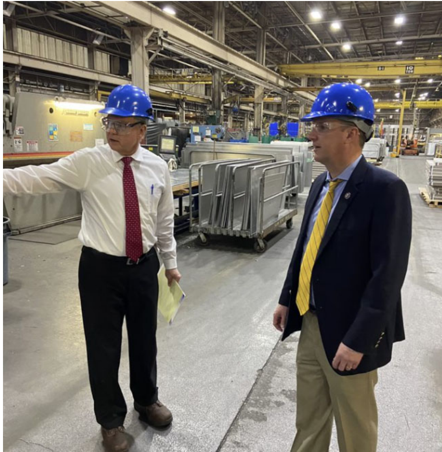
Buffalo Air Handling (Amherst)