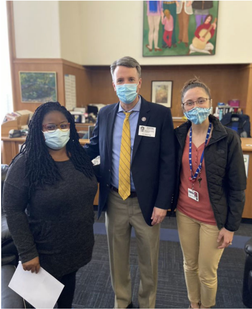
E.C. Glass High School (Lynchburg)