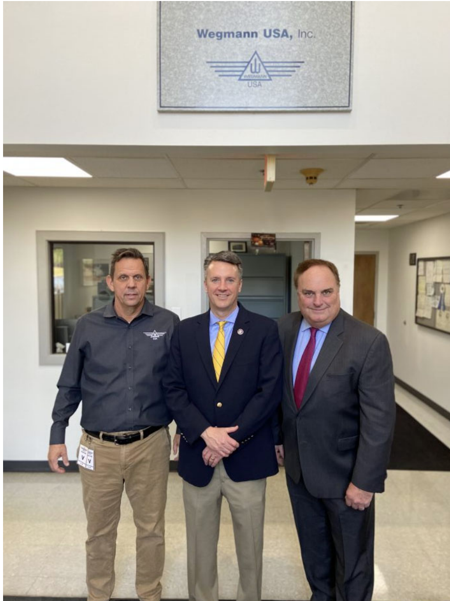
Wegmann USA, Inc. (Lynchburg)