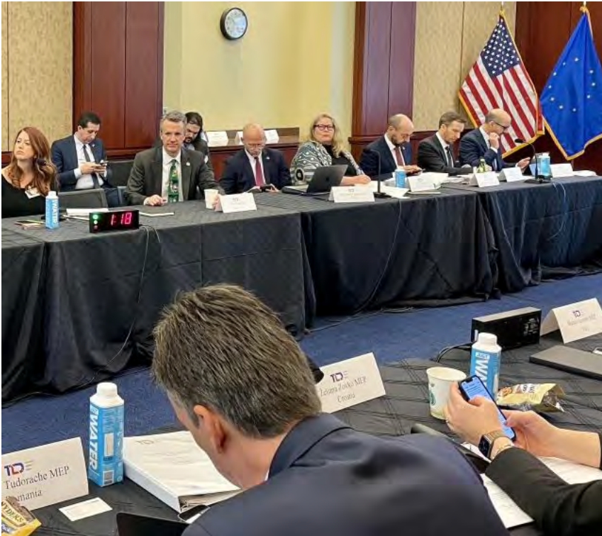
I was pleased to participate in the 87th EU-U.S. Inter-Parliamentary Meeting of the Transatlantic Legislators' Dialogue with members of the European Parliament (MEPs) and my fellow Members of the U.S. House of Representatives to discuss the strong partnership between the U.S. and E.U. and how we can work together to tackle the most pressing global challenges.