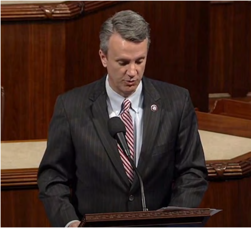
Watch my floor speech recognizing the James Wood volleyball team here or above.