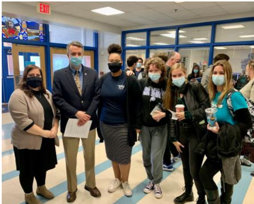
Fort Defiance High School (Fort Defiance)