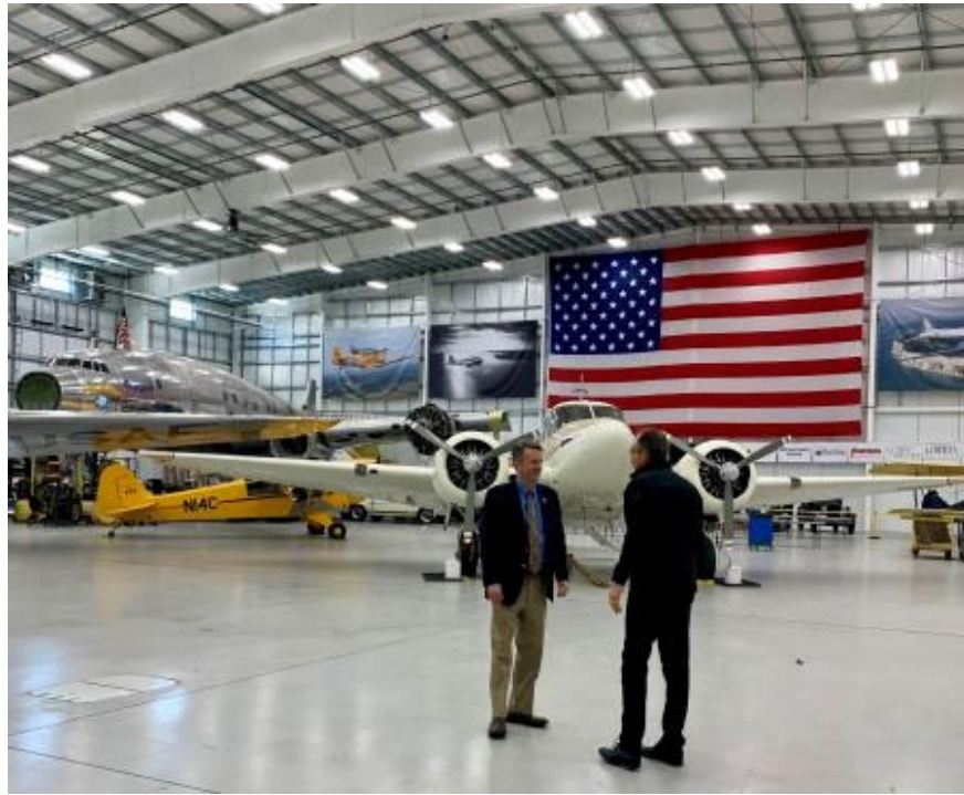
Dynamic Aviation (Bridgewater)