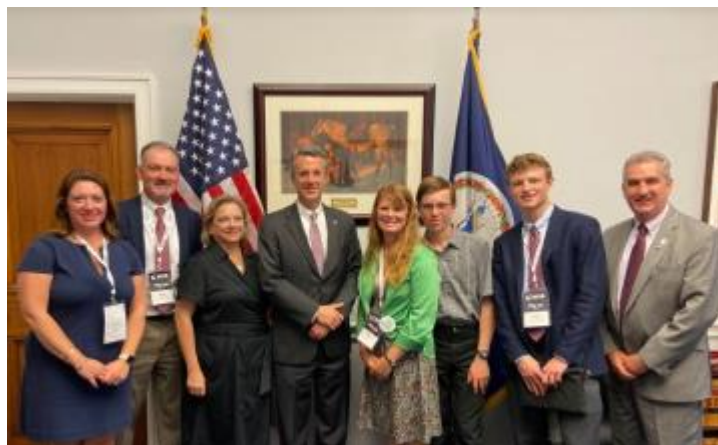
Meeting with members of the National Federation of Independent Businesses (NFIB)