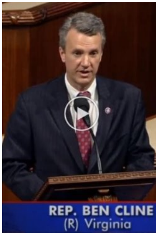
Speaking on the state of the American economy on the House Floor