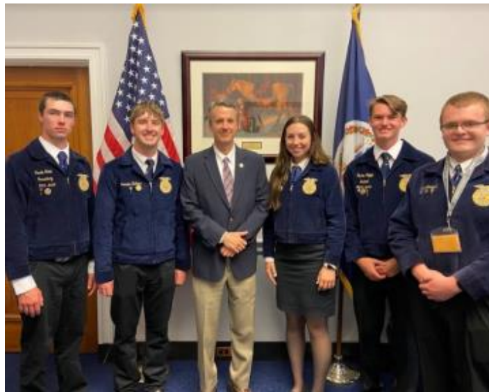
Meeting with students of the Future Farmers of America (FFA)