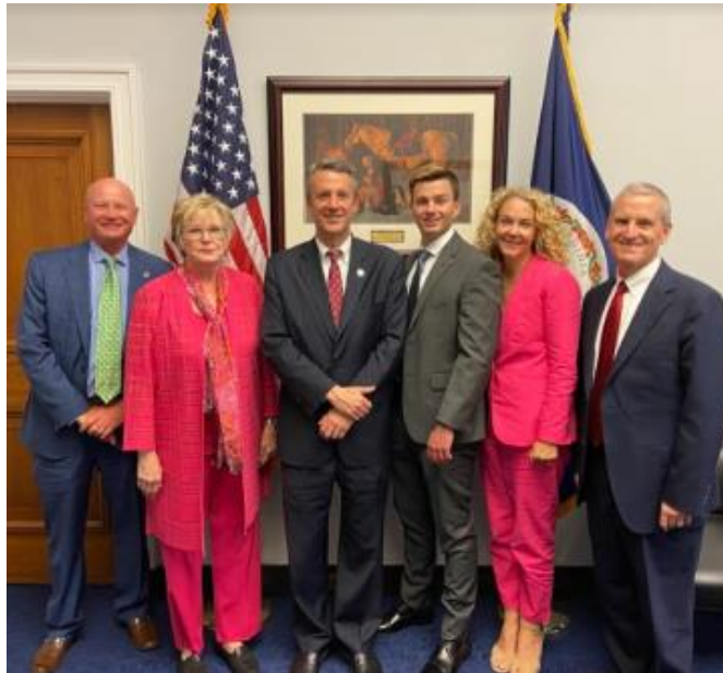
Meeting with a representative of McKee Foods and members of Family Enterprise USA