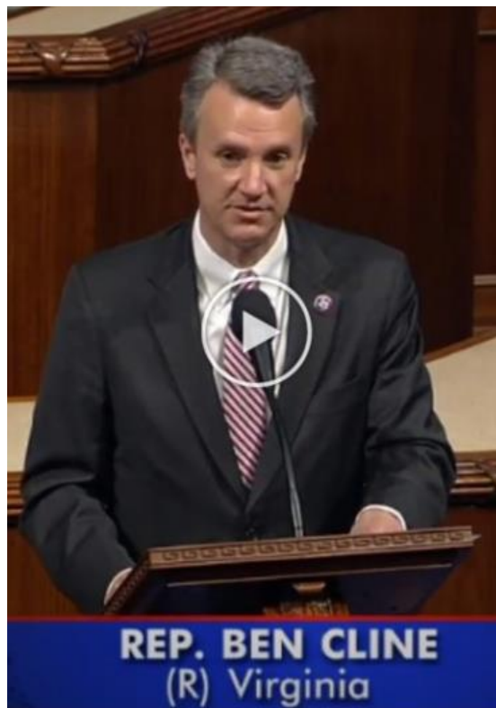
Honoring the Liberty Christian Academy baseball team on the House Floor