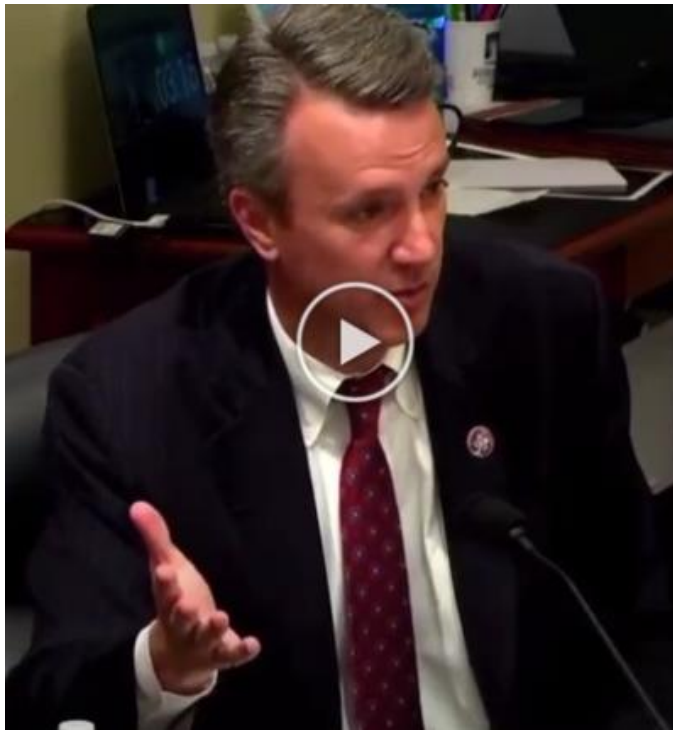
Speaking against the ARP in a recent Budget Committee hearing