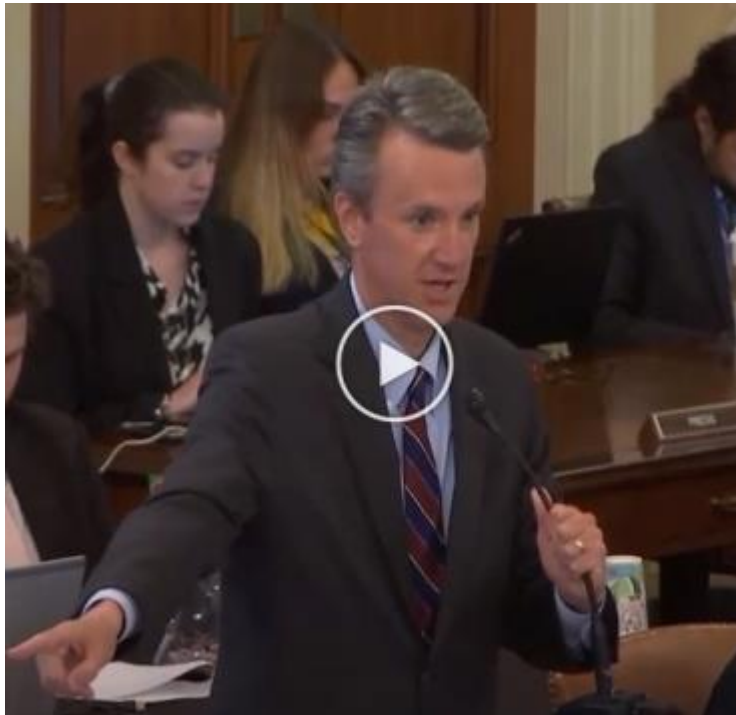
Debating my amendment to prohibit using public health emergencies for the purposes of gun control

In one of the most egregious moves by the Democrats, the historically bipartisan Hyde Amendment was again removed from the bill. As you may know, the Hyde Amendment ensures that taxpayer dollars are not used to fund or perform abortions – a notion that a majority of Americans support. Further, this bill also excluded the Weldon Amendment, which ensures that health care providers cannot be forced to provide abortion services, a protection that until recently was in place since 2005. We should never force our health care workers to participate in an abortion when they have taken an oath to heal and to do no harm. To put a health care provider's license in jeopardy by mandating they perform a procedure they are morally opposed to is simply wrong. Additionally, I also introduced an amendment to the LHHS bill to prohibit the use of a public health emergency to implement gun control. As I argued in debate on my amendment, using emergency powers to disarm the citizenry is the action of a third-world county, not the United States. Remarkably, my amendment was rejected as House Democrats turn a blind eye to the unconstitutional power grabs by President Biden.