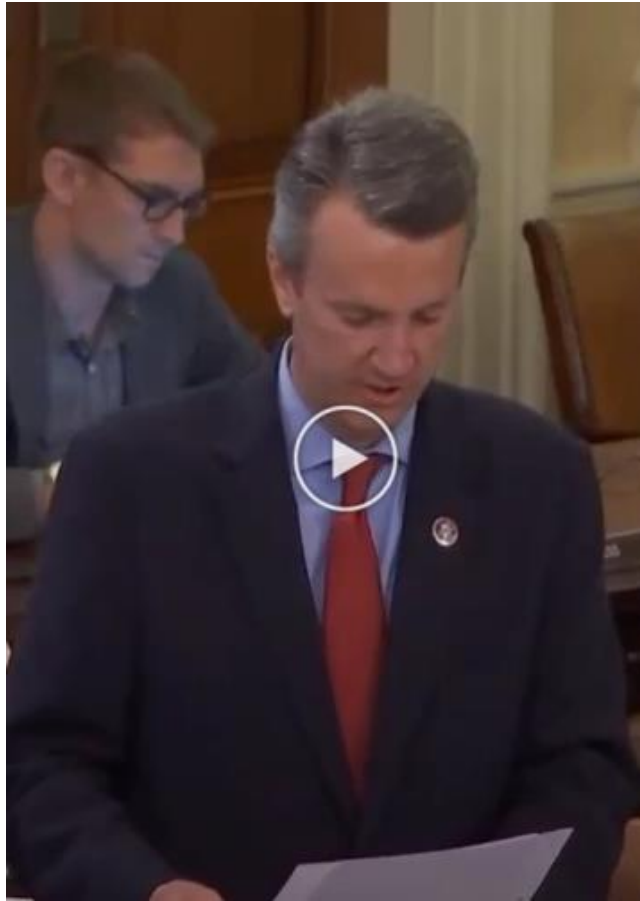
Introducing my amendment to bolster border security

Border Protection. Unfortunately, but not unexpectedly, my amendment was rejected by Committee Democrats.