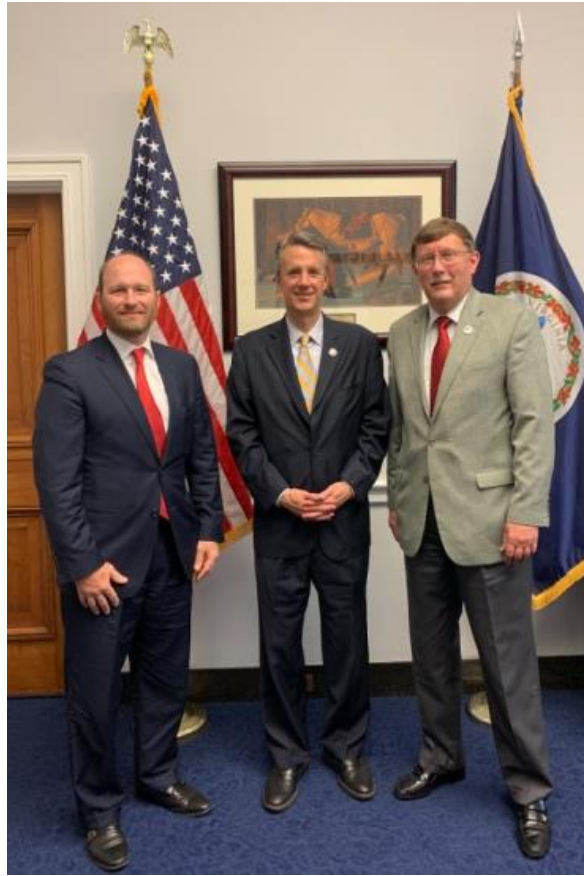
Meeting with the American Association of Christian Schools