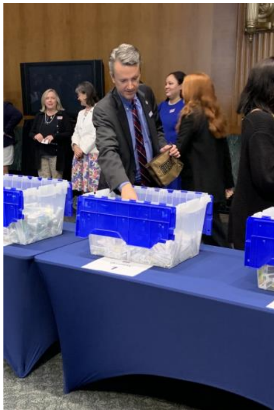
Assembling United Service Organization (USO) care packages for deployed troops