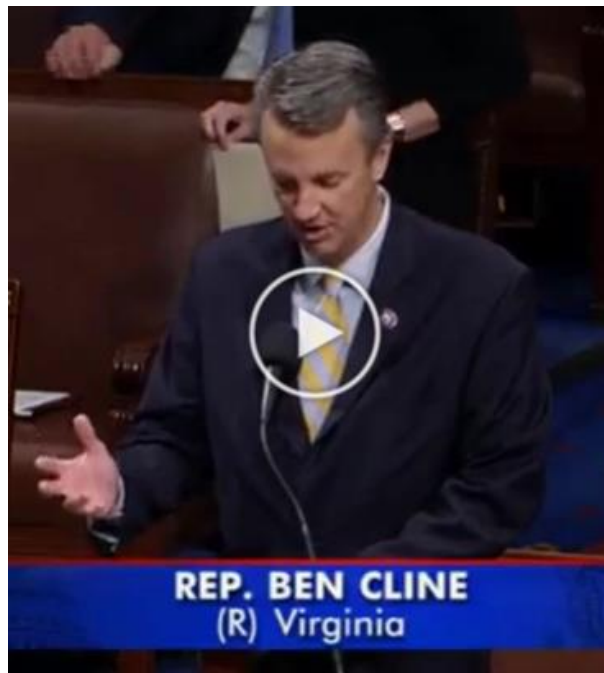
Defending the Second Amendment during House Floor debate