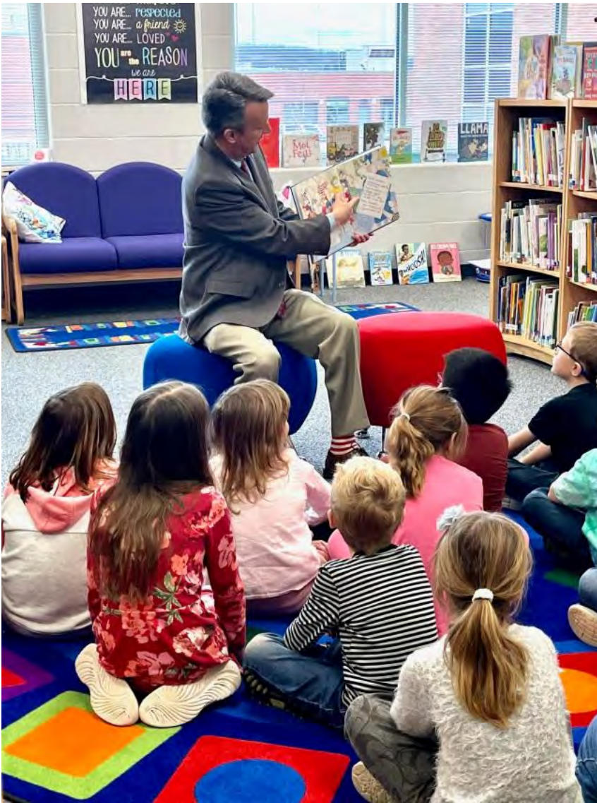
Reading to students at Pleasant View Elementary School in Harrisonburg.