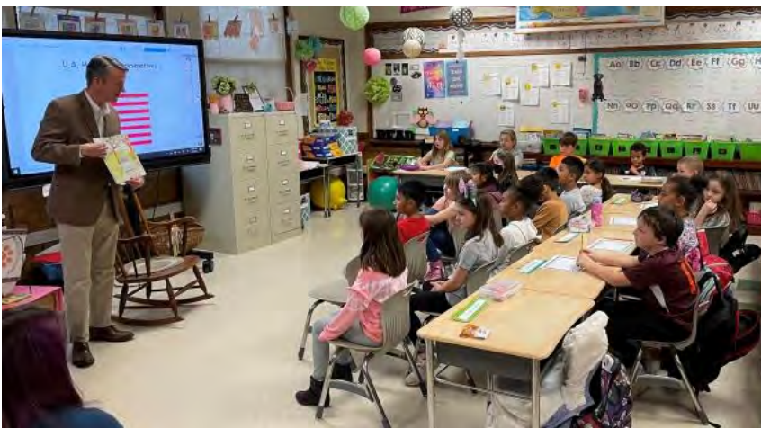
Reading to students at Mount Pleasant Elementary School in Roanoke.

"Coffee With Your Congressman" Town Hall Events